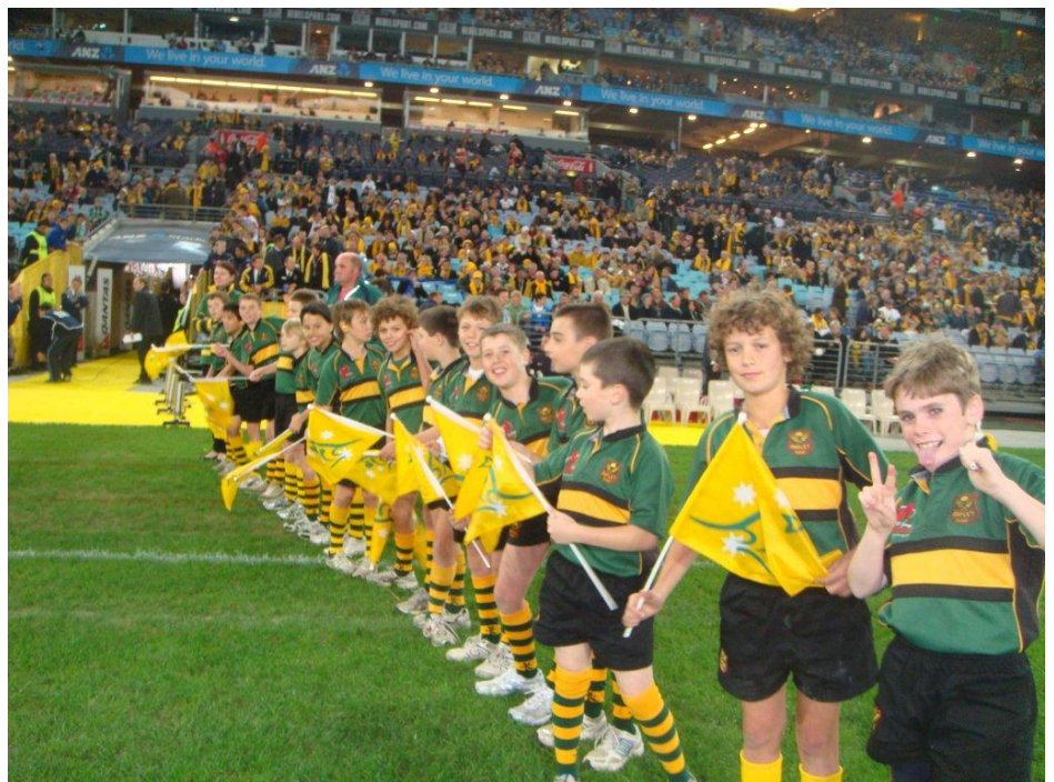
The Under 11's at Stadium Australia Wallabies V England