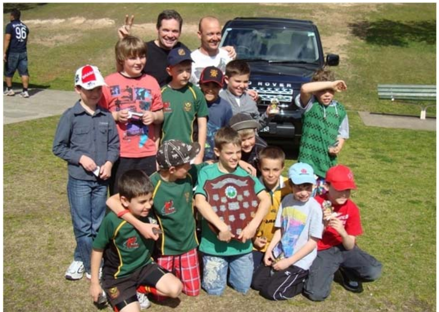
Season presentation day at Evatt Park