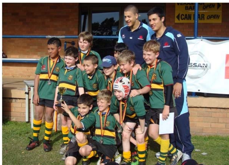
U 9 Eastwood Marist 7's tournament champions!