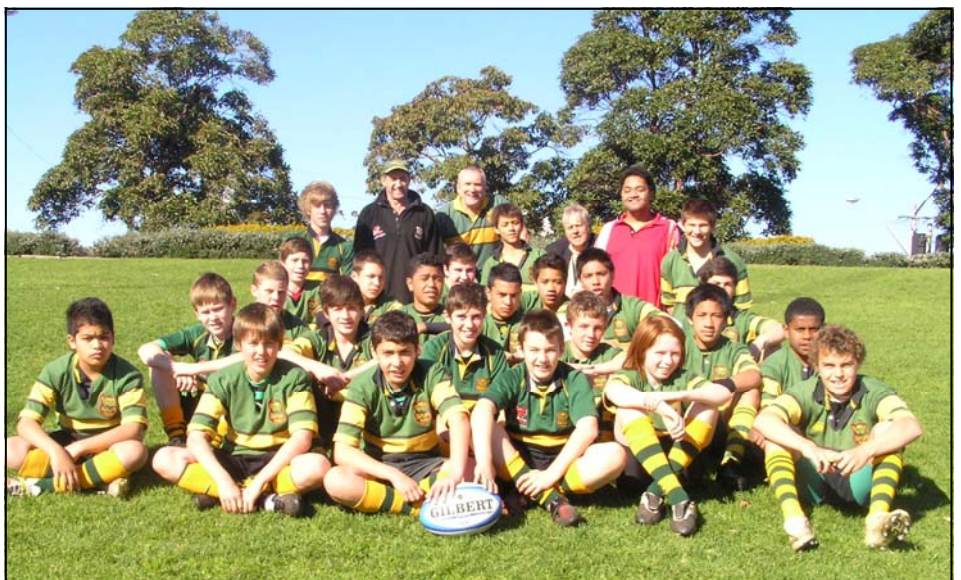
The 2010 Under 13's

From this point forward the boys achieved an unbeaten record in the regular competition claiming the title of Minor Premiers and winning their way through to the Grand Final to also claim the Premiership, remaining undefeated. Oh, and on the way through we had a re-match against Wests Juniors in July and our boys beat them convincingly. Each of the boys is to be admired for forging a cohesive and harmonious team, enabling them to compete so strongly throughout the season. They have put the Oatley U13s and the Oatley club up in lights.