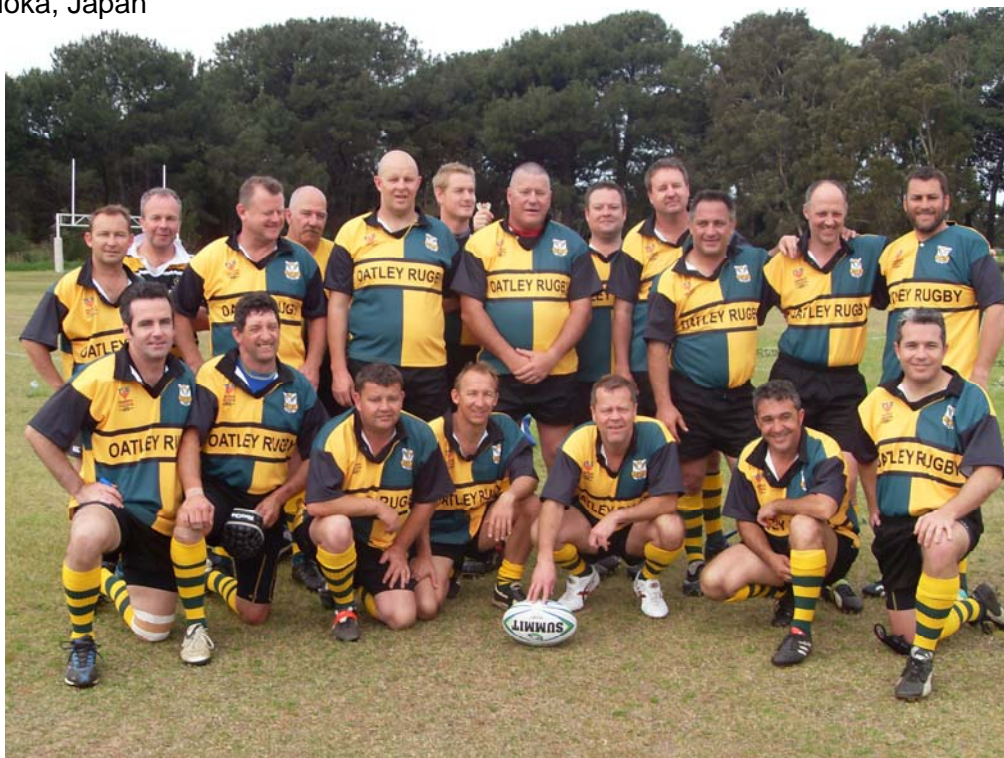
The Wild Oats, competing in the 2010 World Golden Oldies Rugby Festival,