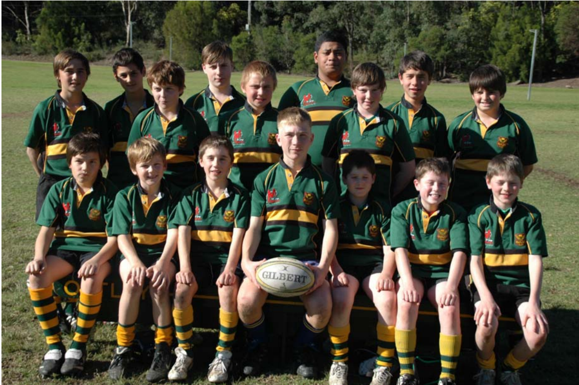
The 2010 Under 12's