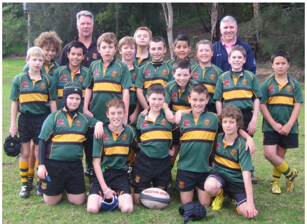
The 2010 Under 11's