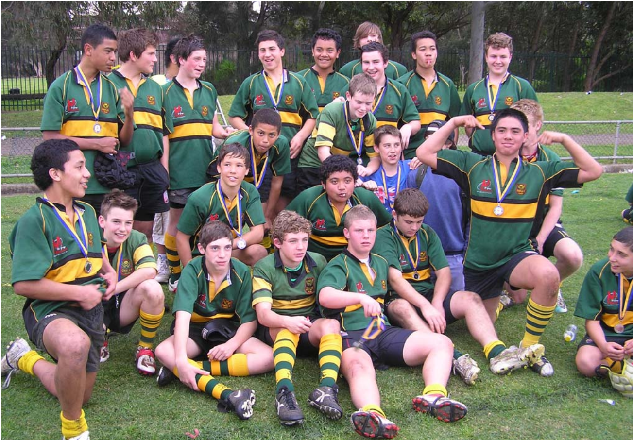
Under 14's 2011 Grand Final Day